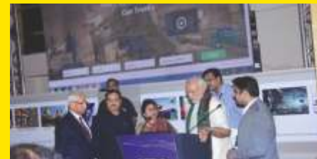
SAARC Trade Mart