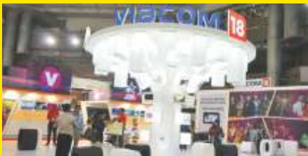
Visitors at the Viacom 18 booth