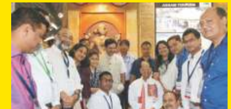
Shri Tarun Gogoi, Chief Minister of Assam at the Assam Pavilion