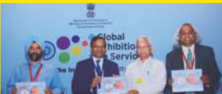
Session on Accelerating the Indo-China Economic Engagement