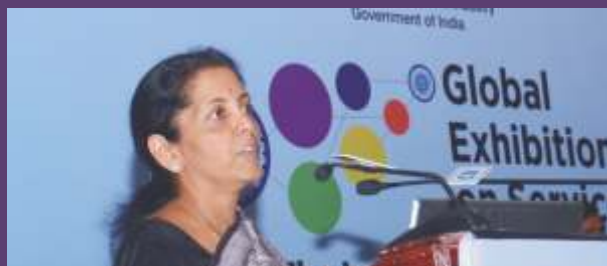
Smt Nirmala Sitharaman , Minister of State for Commerce & Industry (I/C), Government of India

Minister of Finance and Corporate Affairs, Government of India