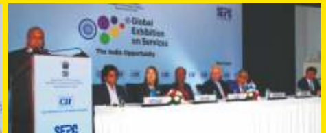
Session on Global Trade on Services – The Australia Experience