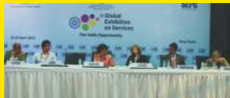
Session on Medical Value Travel in India