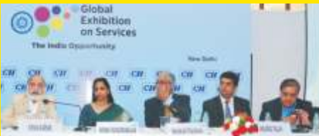
Session on Accelerating the Digital Transition