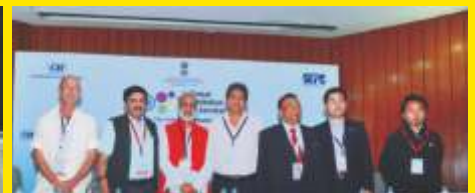
Session on Tourism – The Wonder that is India