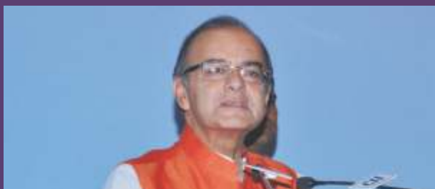
Shri Arun Jaitley

Minister of Finance and Corporate Affairs, Government of India