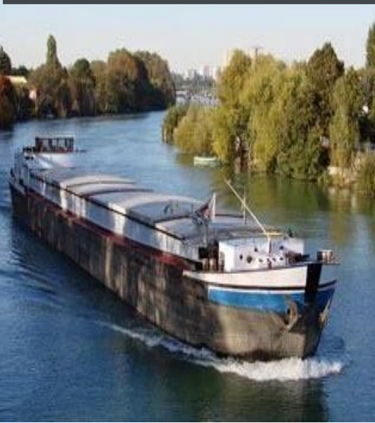
Coastal shipping & IWT